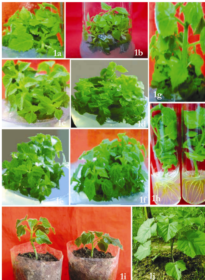
Figs 1a-j. In vitro regeneration of Paulownia tomentosa . a-b. Multiple shoot regeneration from shoot tip and leaf segment explant on MS supplemented with 3.0 mg/l Kn and 0.5 mg/l NAA. c - d. More shoots after first subculture in the same medium. e - f. Positive effect of 10% CW on increase the number of shoots in shoot tip explant and leaf segment explant. g. Effect of 100 mg/l urea on shoot elongation. h. In vitro root induction on half-strength MS supplemented with 2.0 mg/l NAA. i. Regenerated plantlets in poly bag containing a mixture of soil and compost in 2 : 1 ratio. j. Survived plant in open field conditions.

For further development of the medium and enhanced shoot proliferation, coconut water (CW 5 - 20% v/v) was added to the medium. Addition of 10% CW increased the number of shoots (15 and 18 in case of shoot tip and leaf segment explant, respectively) per culture (Figs 1e, f). Different concentrations of urea (50 - 150 mg/l) were added to the medium to determination of their effects on shoot elongation. Addition of 100 mg/l urea to the medium increased the length of shoots (Figs 1g, 2). Roy (2008) reported that addition of 10% CW increased the number of shoots